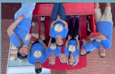
SCOOPS AT NE STATE FAIR AUGUST 25 - SEPTEMBER 4, 2023