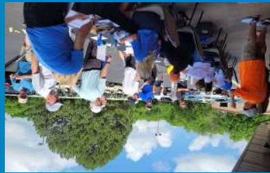
HUW GOLF TOURNAMENT JUNE 5, 2023

Collected and distributed 15,000 pounds of food to 21 local organizations, which equaled 17,010 hot meals for children and families.