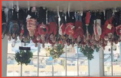
GO BIG GIVE - MAY 4, 2023 TOTAL RAISED IN 2022: $1,470,731